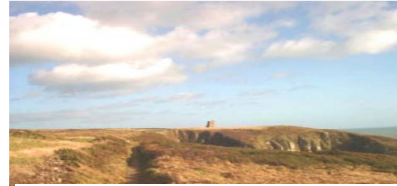
Part of the Cliff Walk

This is only an introduction to the wild flowers on the Cliff Walk, there are many more to be seen which have not been documented on this leaflet. It is hoped the walker will enjoy noting what is in season on this visit, and return soon to look for more wildflowers at Ardmore.