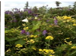
Birds Foot trefoil