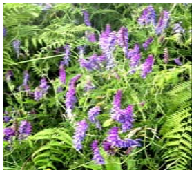
Tufted Vetch Peasair