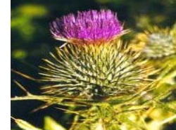
Common Knapweed Minscoth,