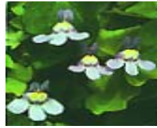
Common Dog Violet