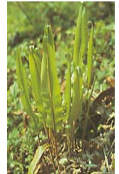
Hart's Tongue Creamh Na Muice Fie