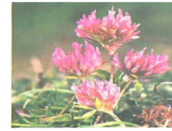
Red Clover Seamair dearg