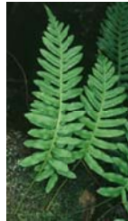
Polypody Fern Scim Chaol