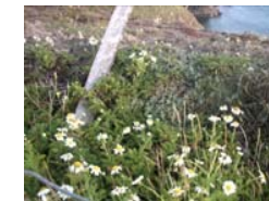
Oxeye Daisy Noinin Mor