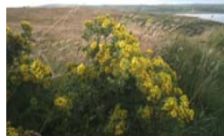
Common Ragwort Bua-