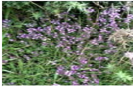
< wild thyme