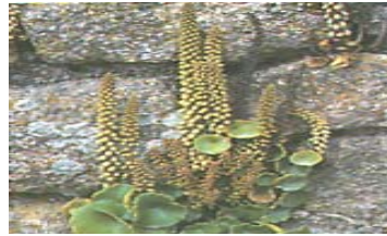
Pennywort or Navelwort Cornan Caisil