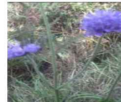
Field Scabious Cab an Ghasain