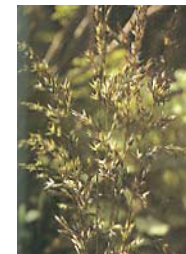
False Oat Grass