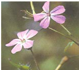
Herb Robert Crobh Cruinn,eireaball ri