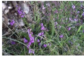
Bell Heather Fraoch Cloigineach