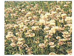
White Clover Seamair