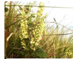
Wood Sage Iur Sleibhe