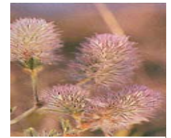
Hare's Foot Clover Lapa ghi-