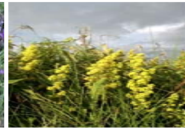
Ladys Bedstraw Boladh