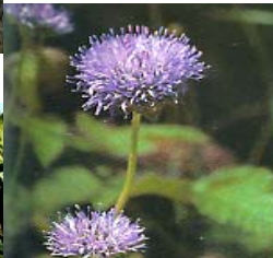
< Pyramid Orchid