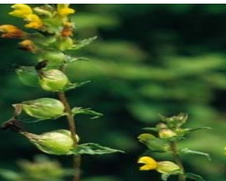
< Kidney Vetch